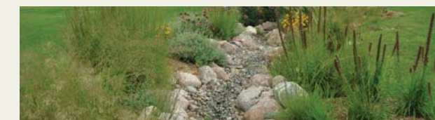
Example of Vegetated Bio-Swale