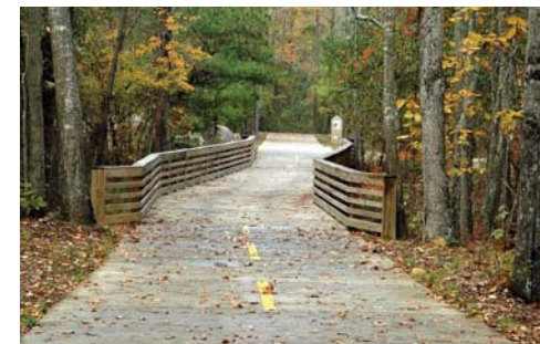
Arabia Mountain Trail | DeKalb County, GA