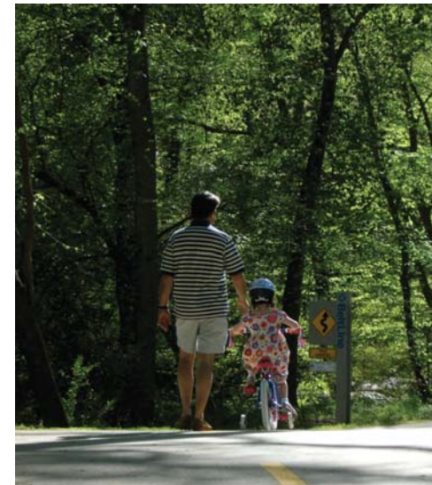
Tanyard Memorial Trail | Atlanta, GA