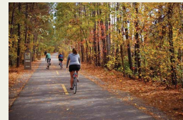
Silver Comet Trail | DeKalb County, GA