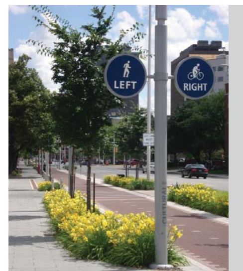
Cultural Trail | Indianapolis, Indiana

The GA 400 Trail is the backbone of the Buckhead Collection, the Greenspace Action Plan for Council District 7 in Buckhead initiated by Councilman Howard Shook in 2010. Envisioned as a paved, 8' – 14' wide multi-use path for bicyclists, skaters, walkers and runners, it will be the primary spine of the Buckhead Collection's Trails and Greenways System connecting Buckhead neighborhoods to parks, trails, schools,