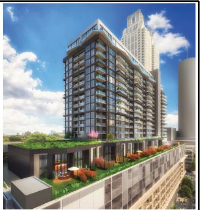
FUTURE 161 PEACHTREE CENTER AVENUE