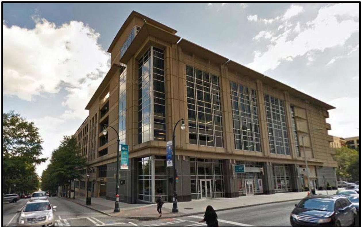
CURRENT SITE CONDITIONS